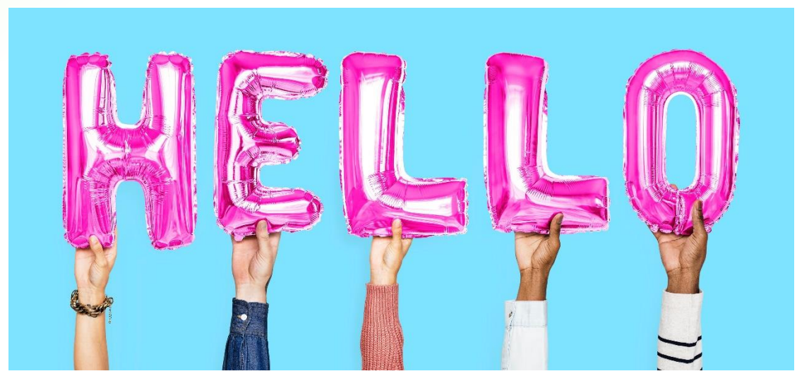
"How to Say Hello in Thai." Learn Thai from a White Guy, 23 Nov. 2020, learnthaifromawhiteguy.com/how-to-say-hello-in-thai/.