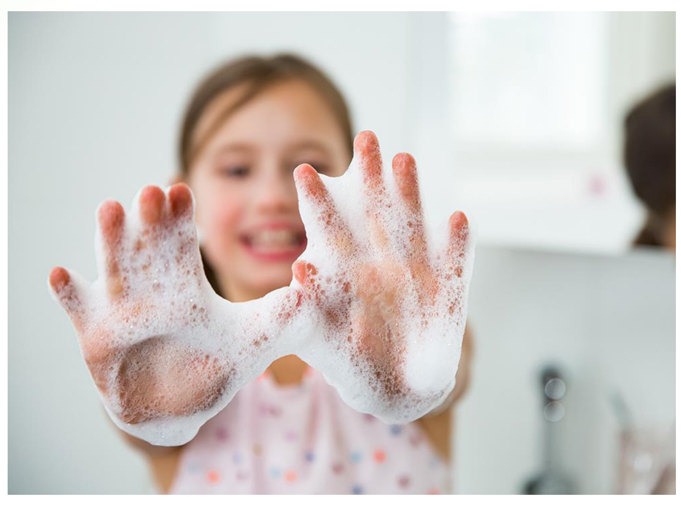
"Health & Safety - Preschool & Daycare Serving North Hollywood, Santa Monica & Van Nuys, CA." Beginnings Learning Center , www.beginningslc.com/health-and-safety/. Accessed 28 Aug. 2023.

A copy of Love n' Learn's Policy Binder is available from the Centre Supervisor.